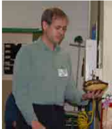
Tim's signature vase went to Al Faul