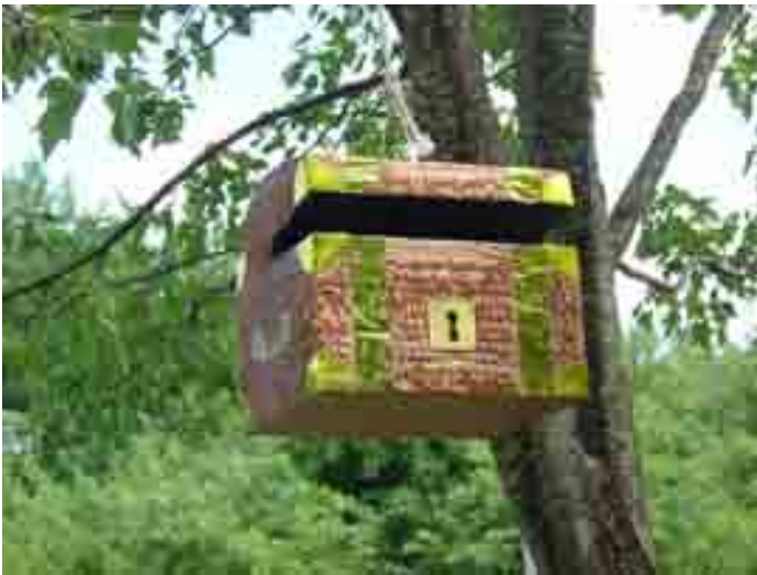
Piñata filled with woodturning goodies