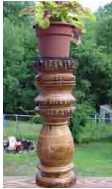
Plant stand by Joe Harbey