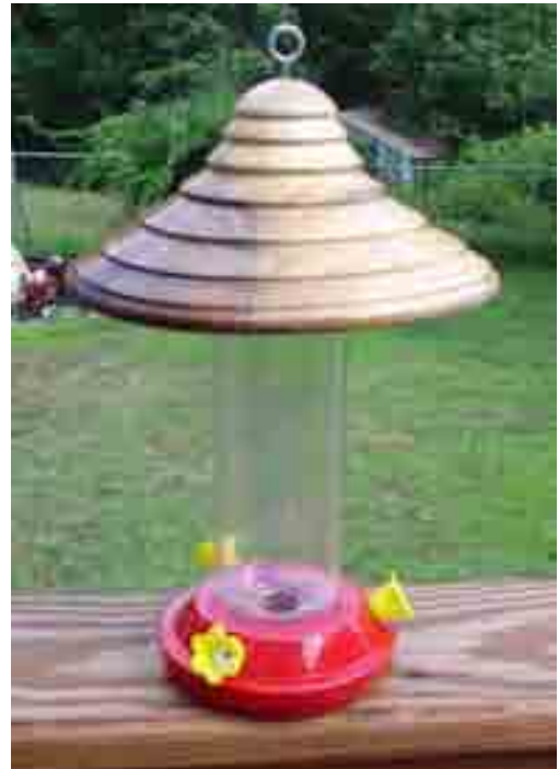
Hummingbird feeder by Al Faul