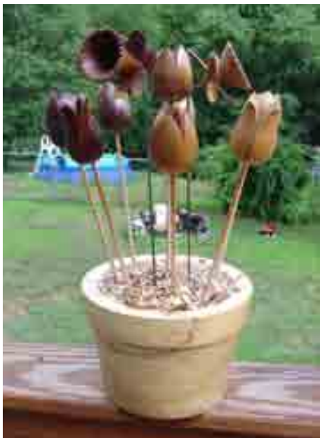
Flowers by Emilio