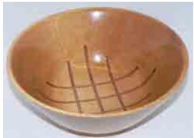
A completed insert bowl

* I use a spacer and cut “outside” the blade. I do not try to cut the spline between the fence and the blade at an 1/8”. Neither should you!