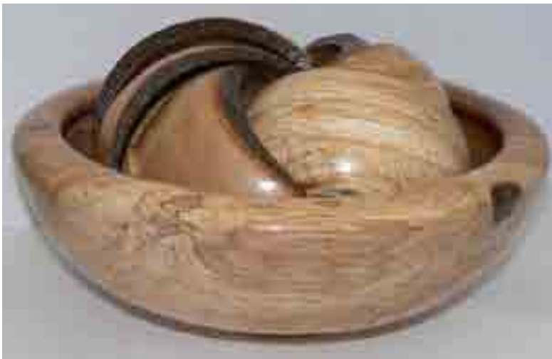
Salad bowl and six serving bowls in spalted copper beech by Joe Harbey