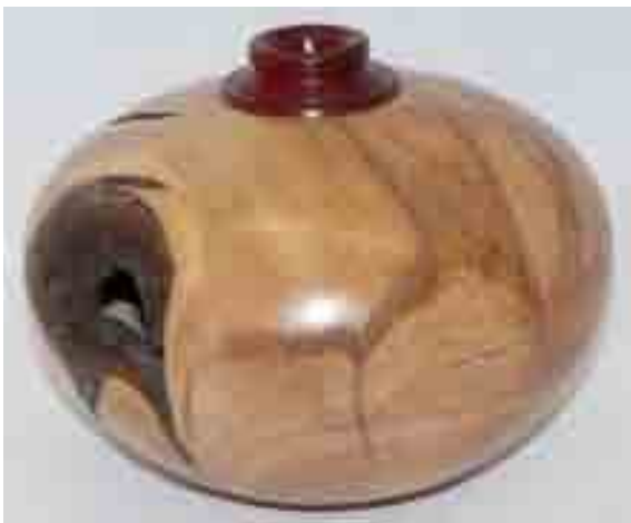
Frank White: Black birch hollow form