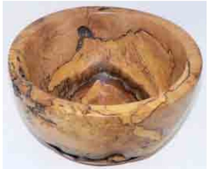
Mike Peters: Spalted maple burl with natural edged cup inside