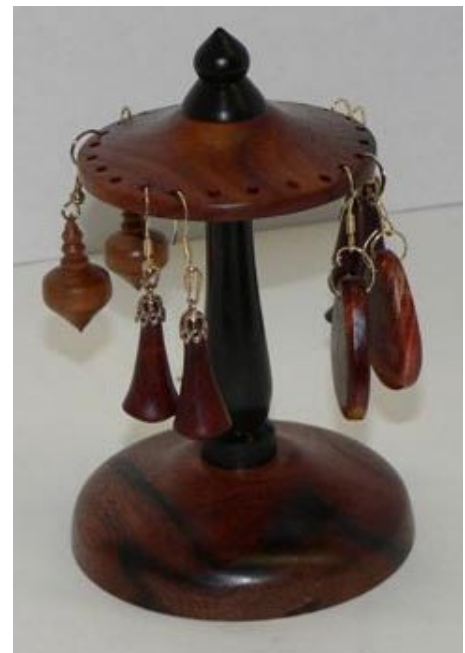
Earring stand and earrings by Bobbi Tornheim