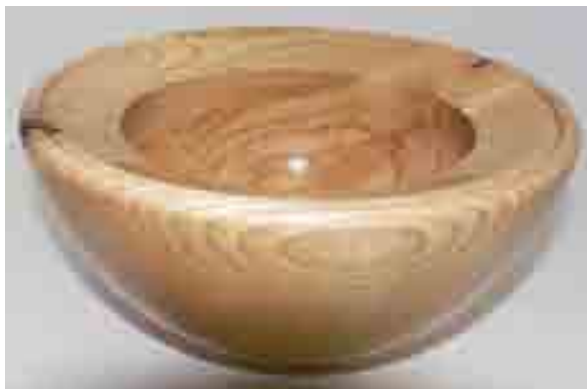
Rick Angus: Crotch elm bowl