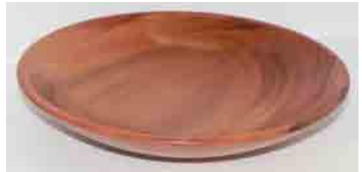
Platter of curupay (a.k.a. cebil) by Bill Frost