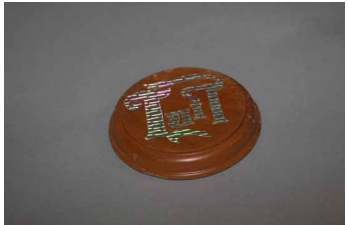
Club Treasures from the Past