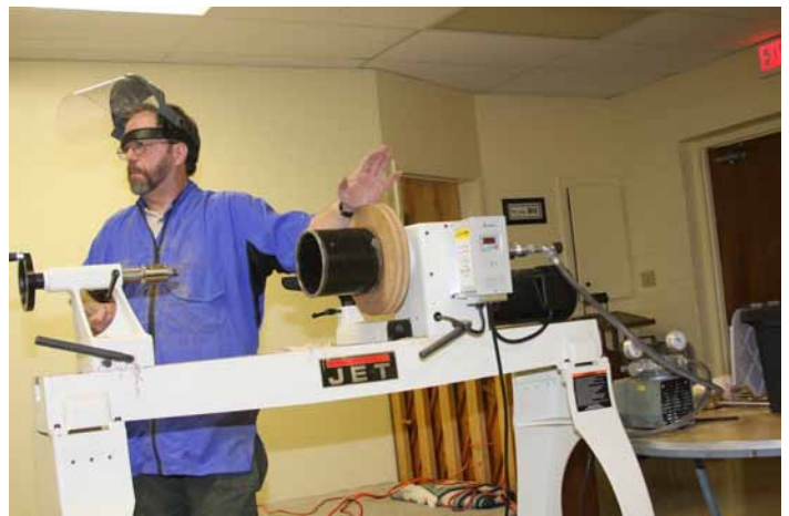
Setting up a vacuum chuck.