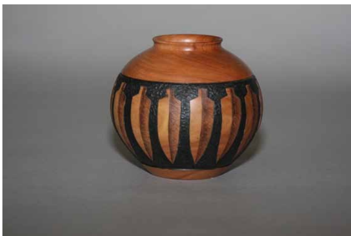
Turned Pyrography by Frank White