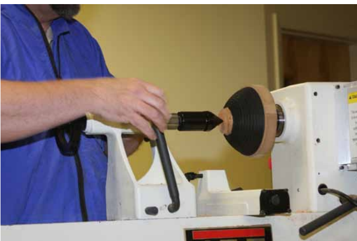
Positioning and holding the bowl for bottom turning.