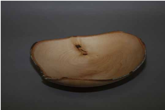
Natural Edge Bowl By Jeremy