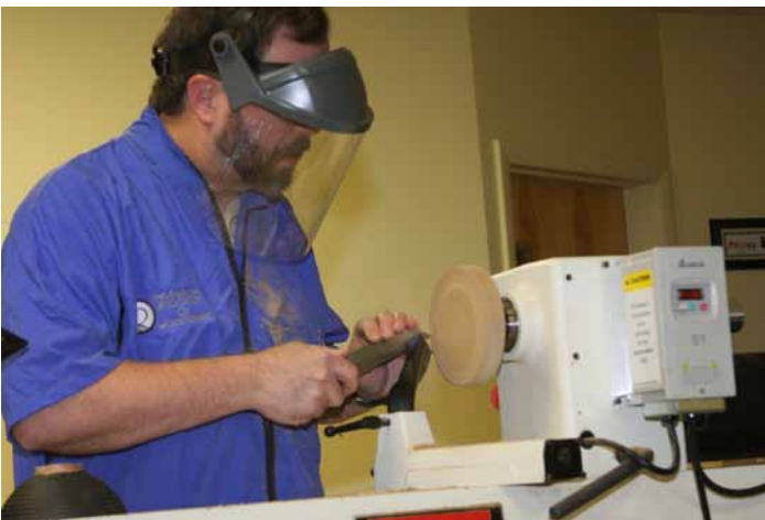
Making a jamb chuck to hold a bowl by the rim.