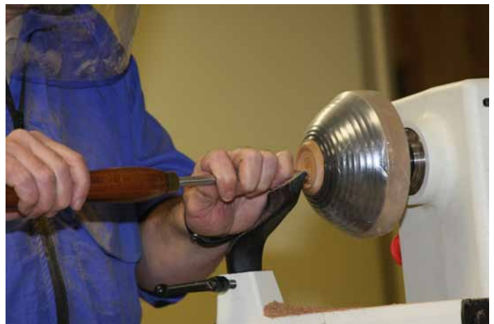
Chuck holding reinforced with clear plastic wrap or packing tape to ensure chuck will hold during bottom shaping.