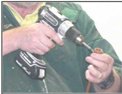
Drill for the perch