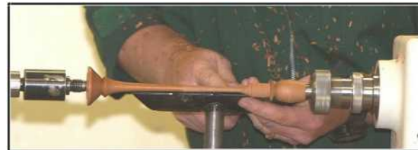
Start shaping the birdhouse