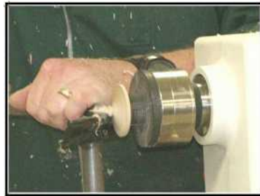
Finishing the roof