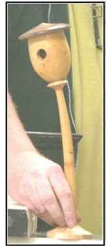
Some Lean a tad