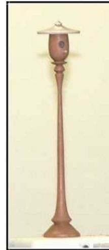
High Rise Complete