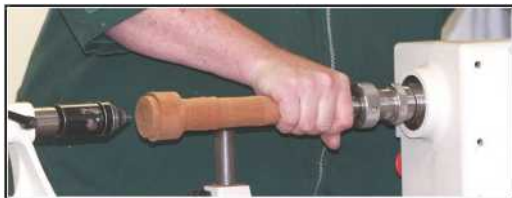
Reverse using pin chuck