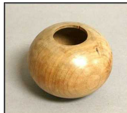
6 Guys open shop effort