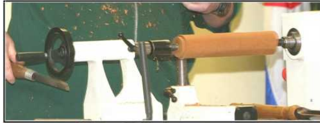
Turn round, add a tenon