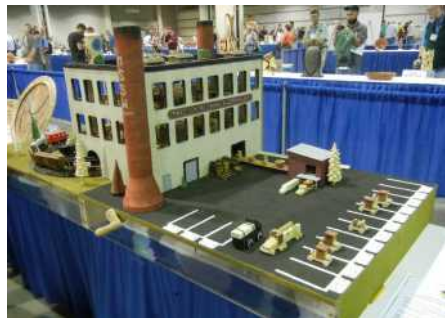
Chapter Collaborative Mass. South Shore

equipment. A glossy handout book given to all attendees offered over 200 pages of information and instructions that in itself is almost worth the price of admission. I have been to several symposiums and would highly recommend anyone interested in seeing other techniques and improving their turning skills to attend. It's a very full three days.