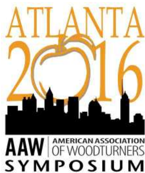
Next Year June 9-12